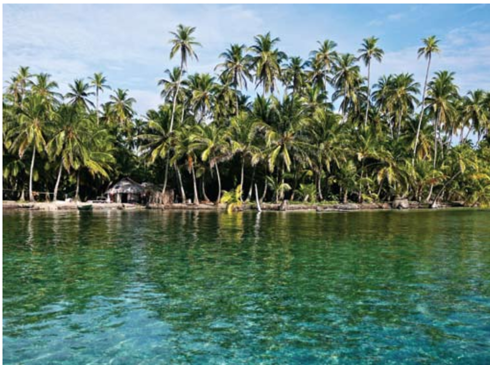
In the mid-19th century, the Kuna people began moving to the San Blas islands off present-day Panama, eventually establishing 38 communities on the archipelago and retaining 11 on the mainland. On account of rising sea levels, however, Kuna leaders are promoting a collective move back to the mainland.