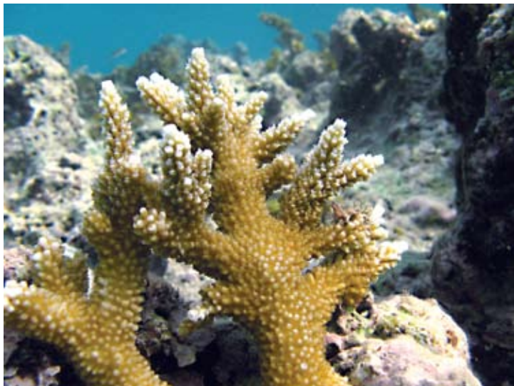
Deterioration of reefs create unwelcome ripple effects